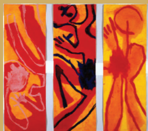
Valérie Crausaz France Untitled , 1998 Color engraving on Arches paper Art Collection of the Inter- American Development Bank