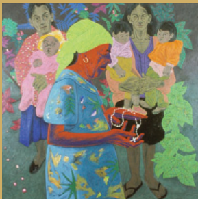
Enrique Collar Paraguay The Medicine Woman (La curandera) , 1973 Oil on canvas Art Collection of the Inter- American Development Bank