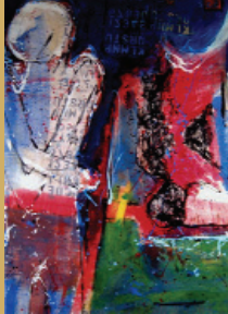
George Struikelblok Suriname I miss you , 2000 Oil and acrylic on canvas Art Collection of the Inter- American Development Bank