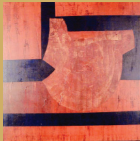
Bayardo Blandino Nicaragua Fragmentary spaces (Espacios fragmentarios) , 1997 Oil and acrylic on canvas Art Collection of the Inter- American Development Bank