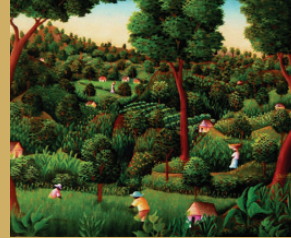
Joseph Jean-Gilles Haiti Haitian Landscape , 1970 Oil on canvas Art collection of the Inter- American Development Bank