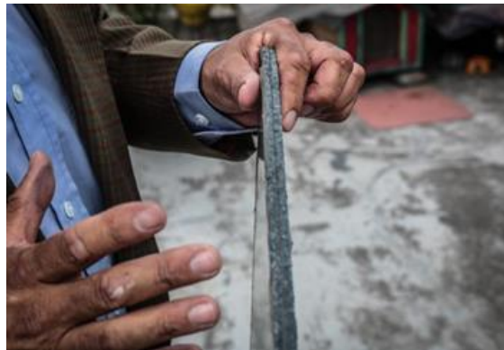
Left: Example of soundproofing measures at the home of a Requester; right: Image of one of the windows installed during the soundproofing process