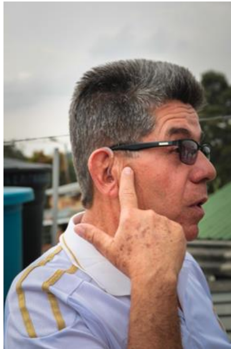
Left: Meeting between the Panel and the Requesters at a home close to the Second Runway threshold; right: Requester reporting hearing loss